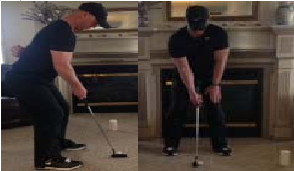
“One Arm Cabin Fever Drill” – A great way to tighten up your stroke preseason

I love this drill because it stresses the two most important components of a good putting stroke.