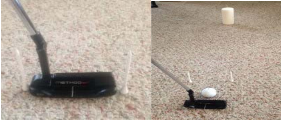
Measure the tee width and aim at the skinny candle